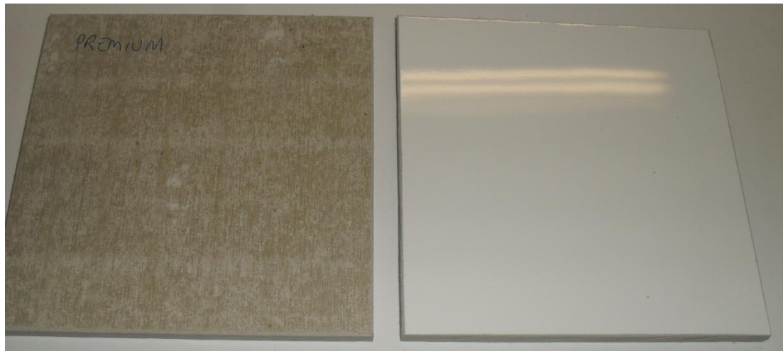
Figure 1 Representative specimen (back face on left, exposed face on right)

The product submitted by the client for testing was identified by the client as 'Fenta' comprising UV and Polyurethane 2K coatings on the exposed face of a 6.0 mm fibre cement board. Figure 1 illustrates a representative specimen of that tested.