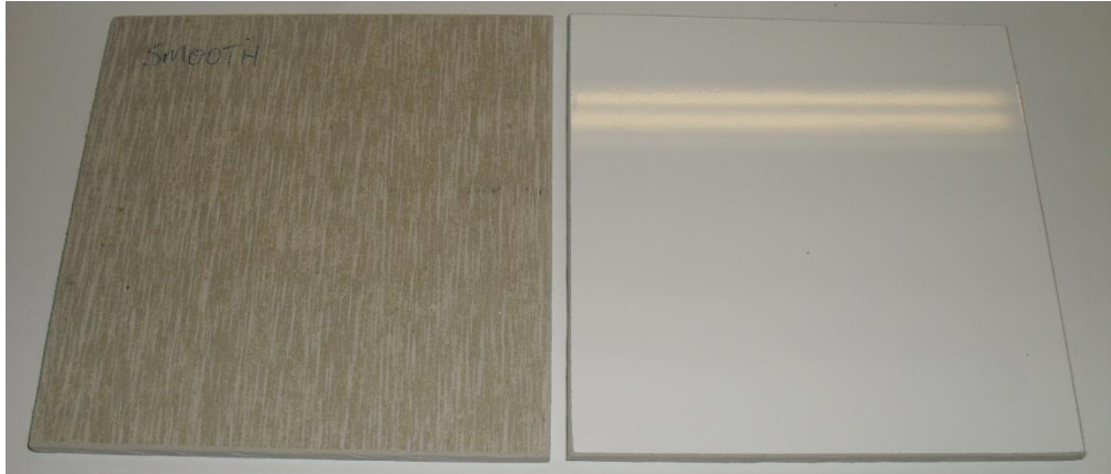
Figure 3 Representative specimen (back face on left, exposed on right)

The results were analysed in accordance with the Group Number Classification requirements, achieving a Group 1 classification.